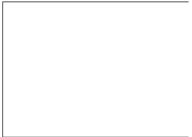
Picture 8A-8B. Maintenance works of previously planted area at Kalumpang VJR107C (Forbes & Sansgter) at Ulu Kalumpang FR Class and 1 Mt. Wullersdorf FR Class 1 within the UKW SFM Project, Sabah